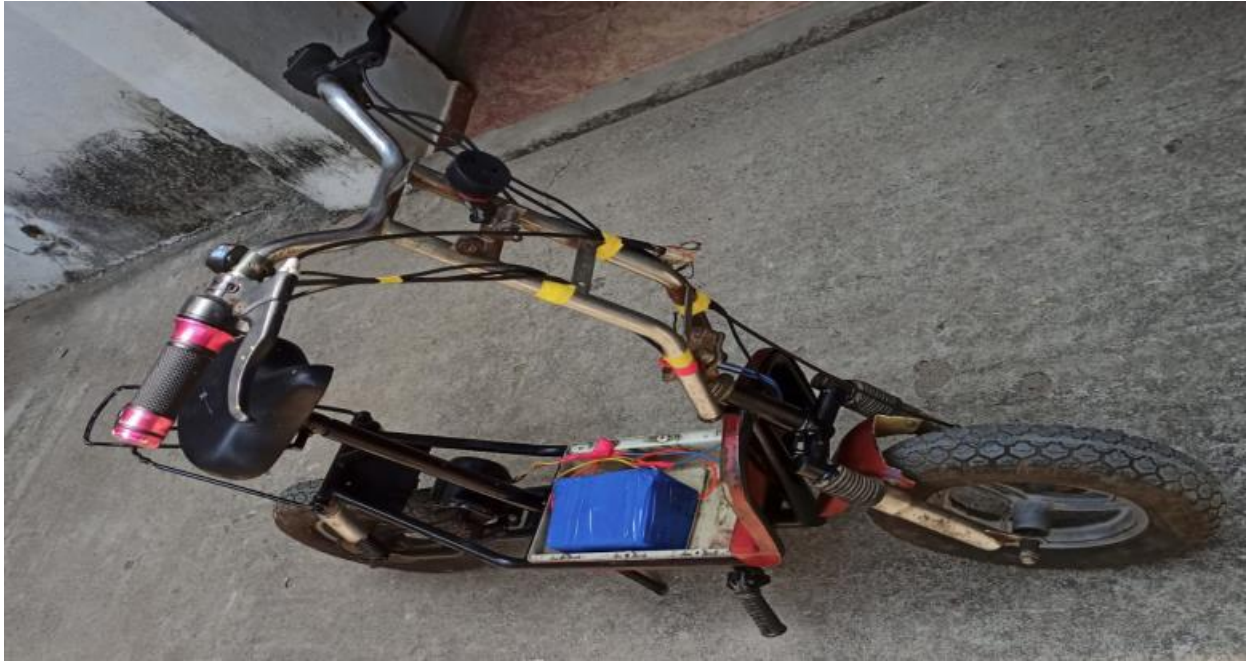
Figure.4. Full View of the Model