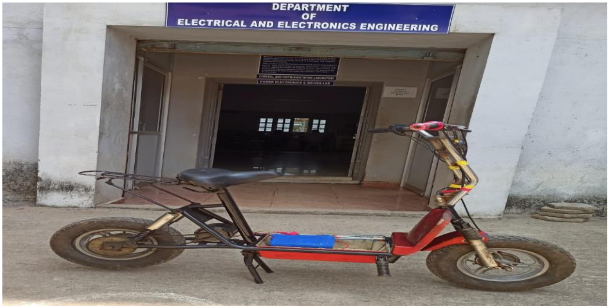
Figure.2. Final Assembled Prototype