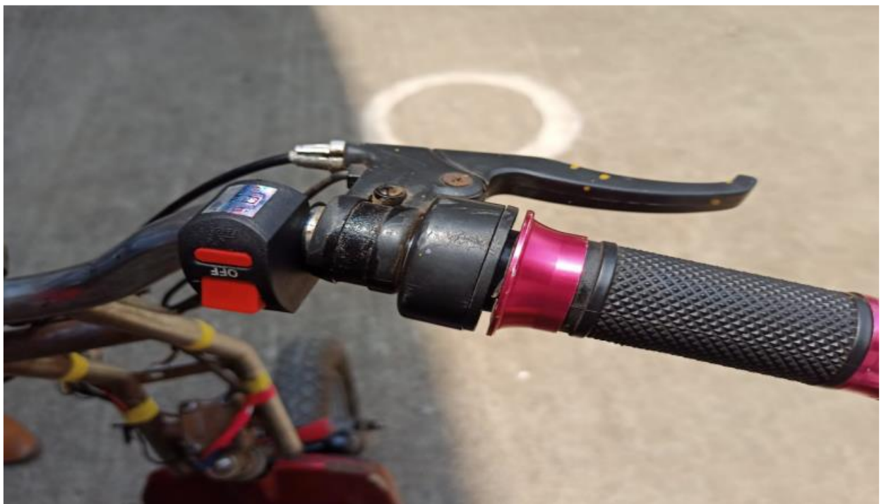
Figure.5. Full View Throttle