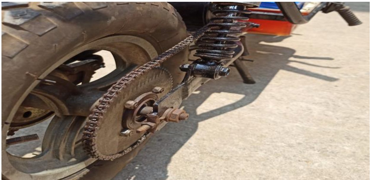
Figure.3. With BLDC Motor